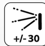
Wide Pose Angle Acceptance