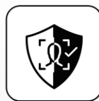
New Height of Anti-Spoofing