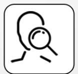
Touchless for Better Hygiene