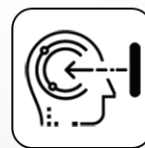
Proactive Facial Recognition