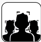
Facial Recognition for Multiple people