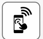
Remote password control